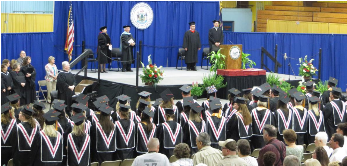
The 231 students in the 2014 NMCC graduating class prepare to receive their degrees.