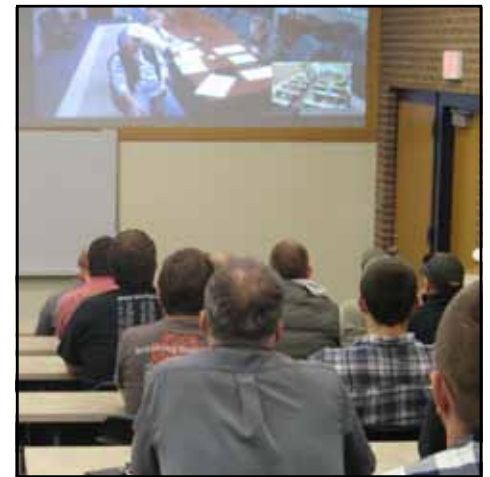
Students listen to officials at Bath Iron Works during a videoconference in the Peter Hunt Multi-Media Classroom.