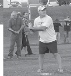
Win or lose, fun was had by all who took part in the alumni/employee versus student softball game, including the spectators cheering from the stands.